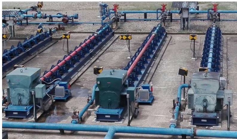
Novomet components used to replace only the failed components in a competitor HPS installation.